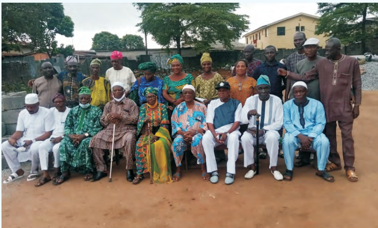
Political and community leaders at the foundation laying of junior secondary school in Shogunle