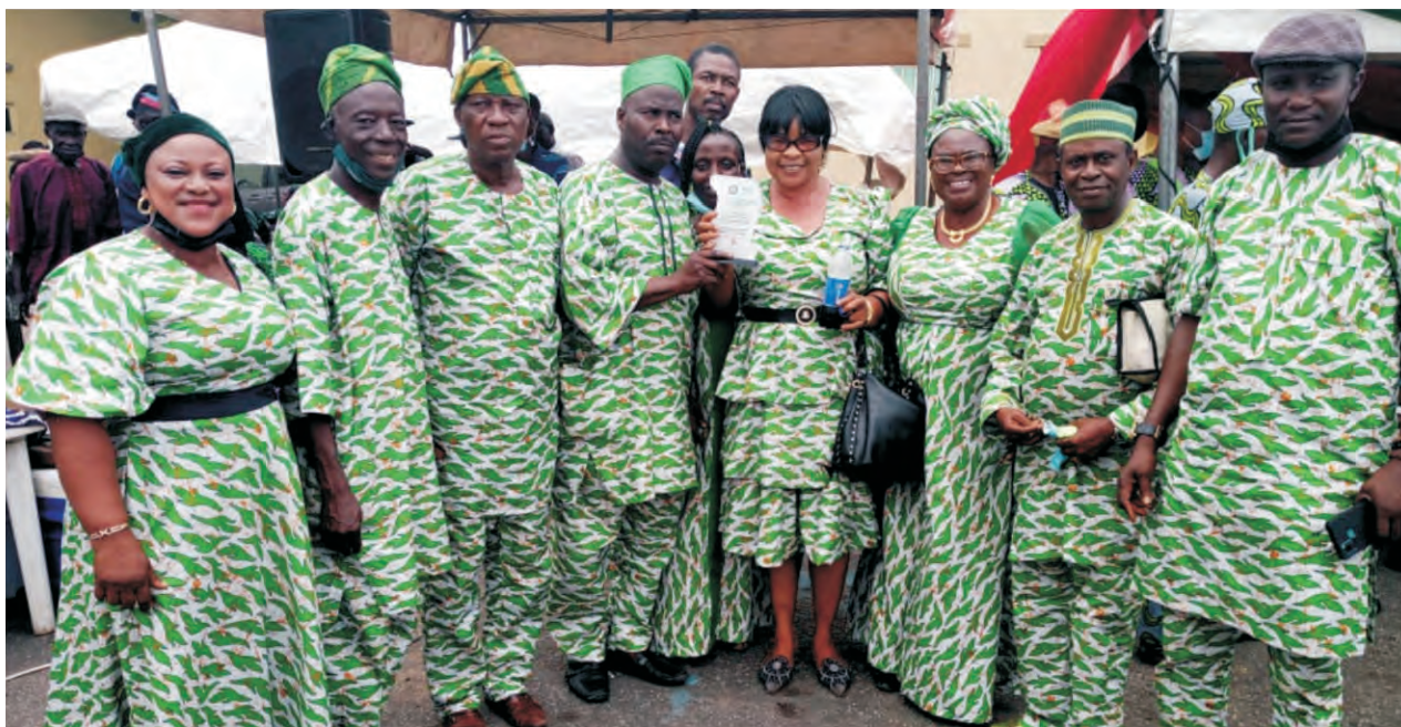
Ejigbo famers in group photograph

Explaining this year's theme "Our Actions are our Future", she